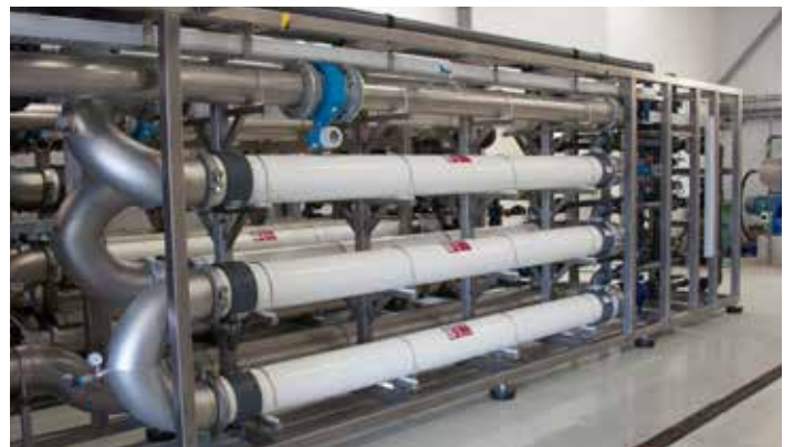
Picture 1. Photo of the B-SMART System installed at Holland Malt

As the world's population increases, so does the level of beer consumption. Studies suggest that by 2025, global beer consumption will grow by 15%. In order to meet the increasing demand, Holland Malt has decided to double its malting capacity in its Eemshaven plant. Unfortunately, doubling the production capacity means doubling the water consumption . Thus, Holland Malt needed a reliable and stable system that could provide high-quality permeate which can be reused for the production of malt while providing significant cost savings . After testing a few pilot systems from various manufacturers, Holland Malt chose the B-SMART MBR filtration system from Berghof Membranes for its reliability, high quality permeate production, ease of use and low maintenance.